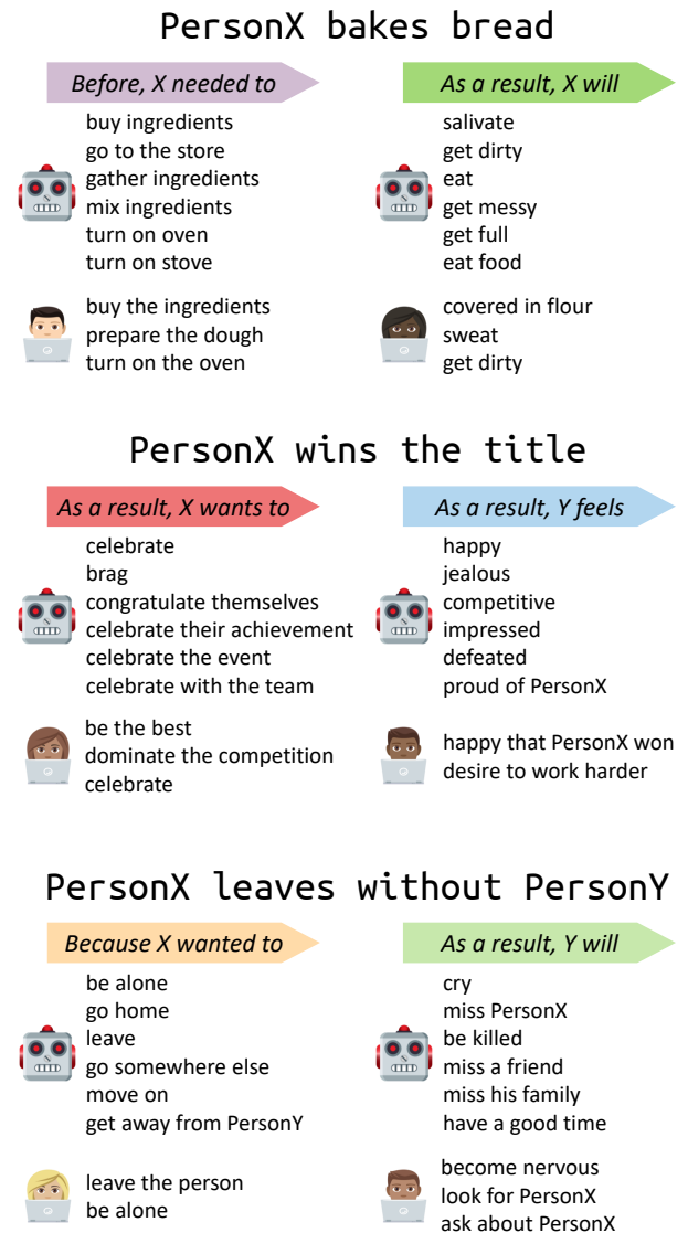
Figure 4: Examples of machine (🤖) generated inferences for three events from the development set, ordered from most likely (top) to least likely (bottom) according to the EVENT2(IN)VOLUNTARY model. Human (👤) generated inferences are also shown for comparison.

We present sample commonsense predictions in Figure 4. Given an event “PersonX bakes bread”, our model can correctly infer that X probably needs to “go to the store” or